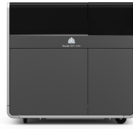
ProJet MJP 2500