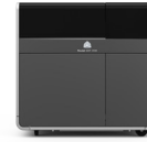
ProJet MJP 2500 Plus