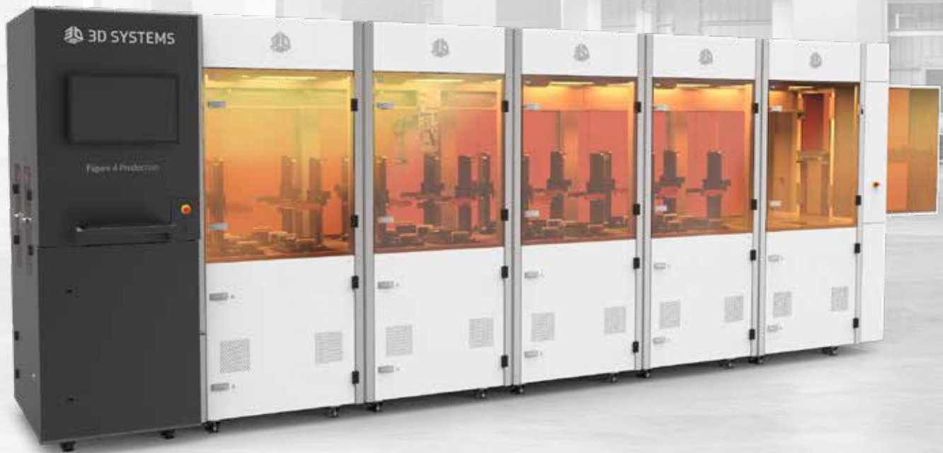
Figure 4 Production combines the design flexibility of additive manufacturing in configurable, in-line production cells to deliver a customizable and automated direct 3D production solution.

Industry's first customizable, fully-integrated factory solution for direct digital production