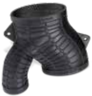
Figure 4 elastomeric materials are ideal for the production of functional rubber-like parts with excellent shape recovery, high tear strength, great for compressive applications and material malleability