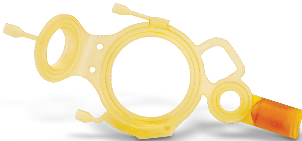
Figure 4™ EGG SHELL-AMB 10