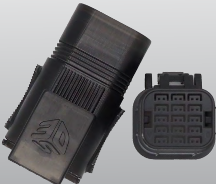
Backplane Connector printed in Figure 4 Tough 75C FR Black