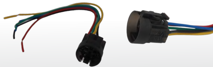
Momentary Socket Connectors printed in Figure 4 Tough 75C FR Black