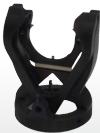
Optical Flexural Fixture printed in Figure 4 Tough FR V0 Black