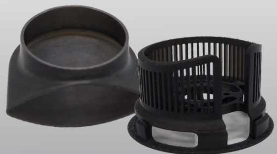
Drone Motor Housing Components printed in Figure 4 Tough FR V0 Black